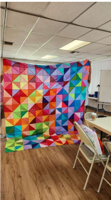
Postcard from Sweden by Lorna Ohl